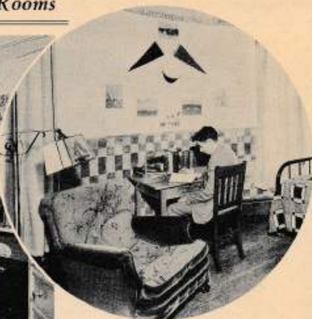
Comfortable living quarters

Firm friendships are formed in the intimate, informal atmosphere at Nichols. Hard work and hard play typify the Nichols man