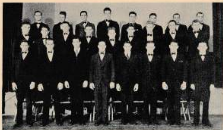
With but one year to its credit, the Nichols Glee Club is making a name for itself