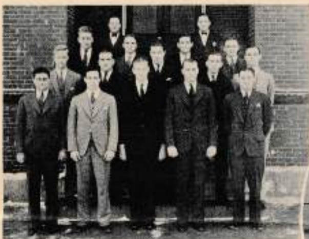
Practical journalism is the aim of the members of the "Nichols Budget" staff