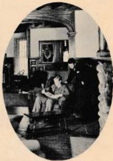
Atmosphere of a select club