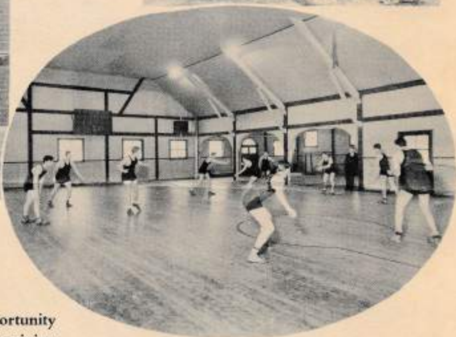
The new gymnasium affords opportunity for indoor sports and physical training